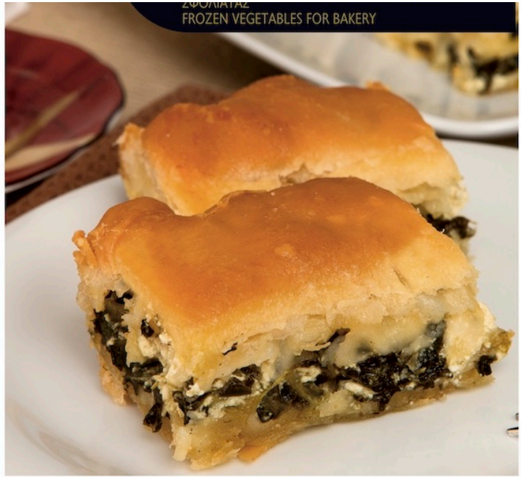
ΣΦΟΛΙΑΤΑΣ FROZEN VEGETABLES FOR BAKERY